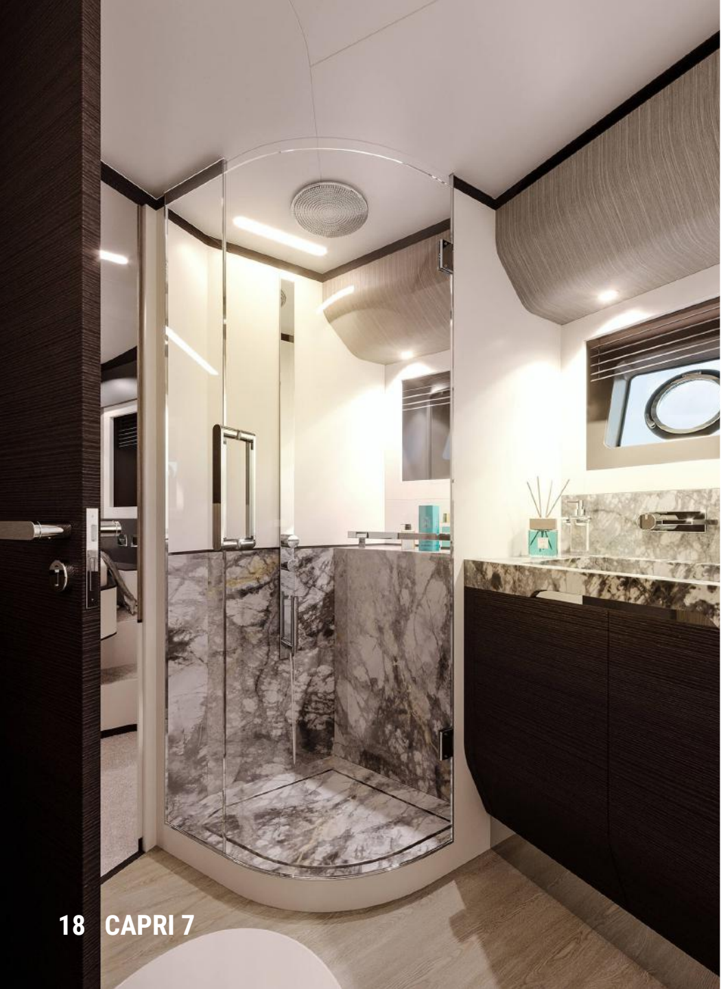
18 CAPRI 7